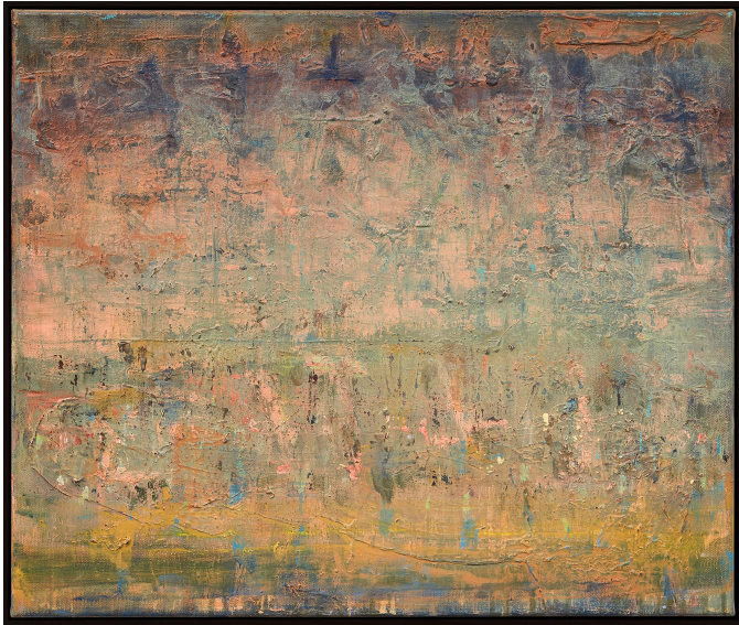
Citrine and Amber Reflections acrylic on linen 52.5 x 62.5 cm (framed)