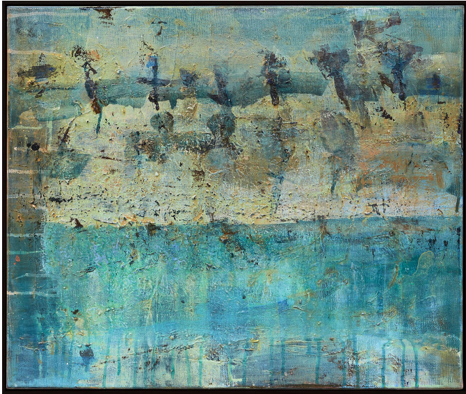
Topas River Study acrylic on linen 52.5 x 62.5 cm (framed)